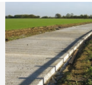
Roadways & pavements