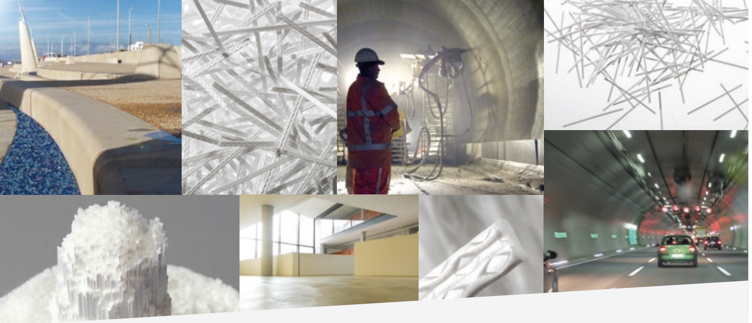
Fig.1 / Durus S500 vs. conventional fibre